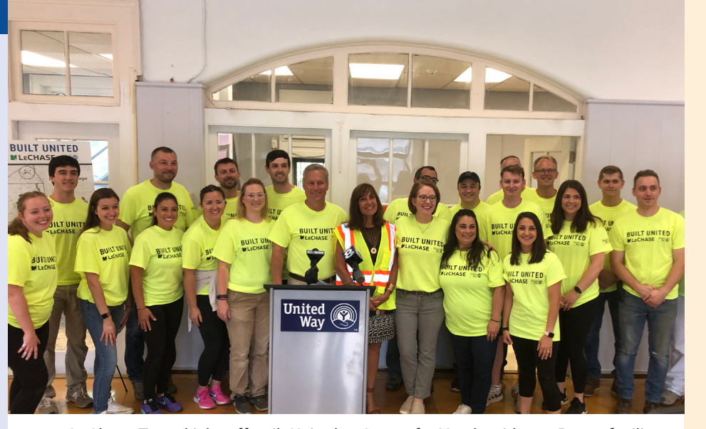
LeChase Team kicks off Built United at Center for Youth Bridge to Peace facility.