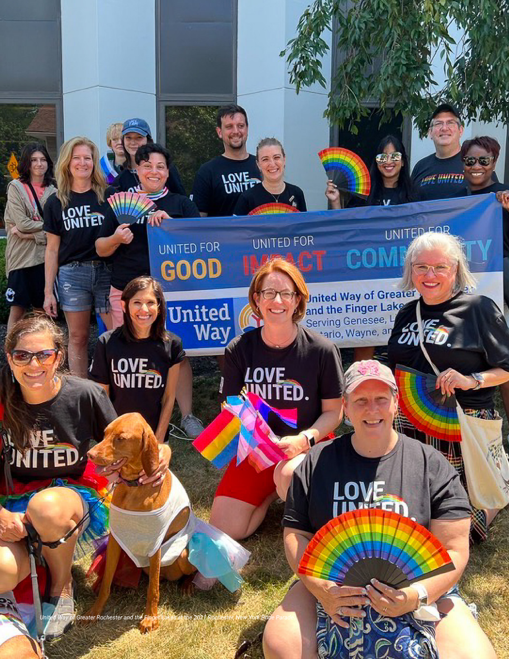
United Way of Greater Rochester and the Finger Lakes at the 2021 Rochester, New York Pride Parade