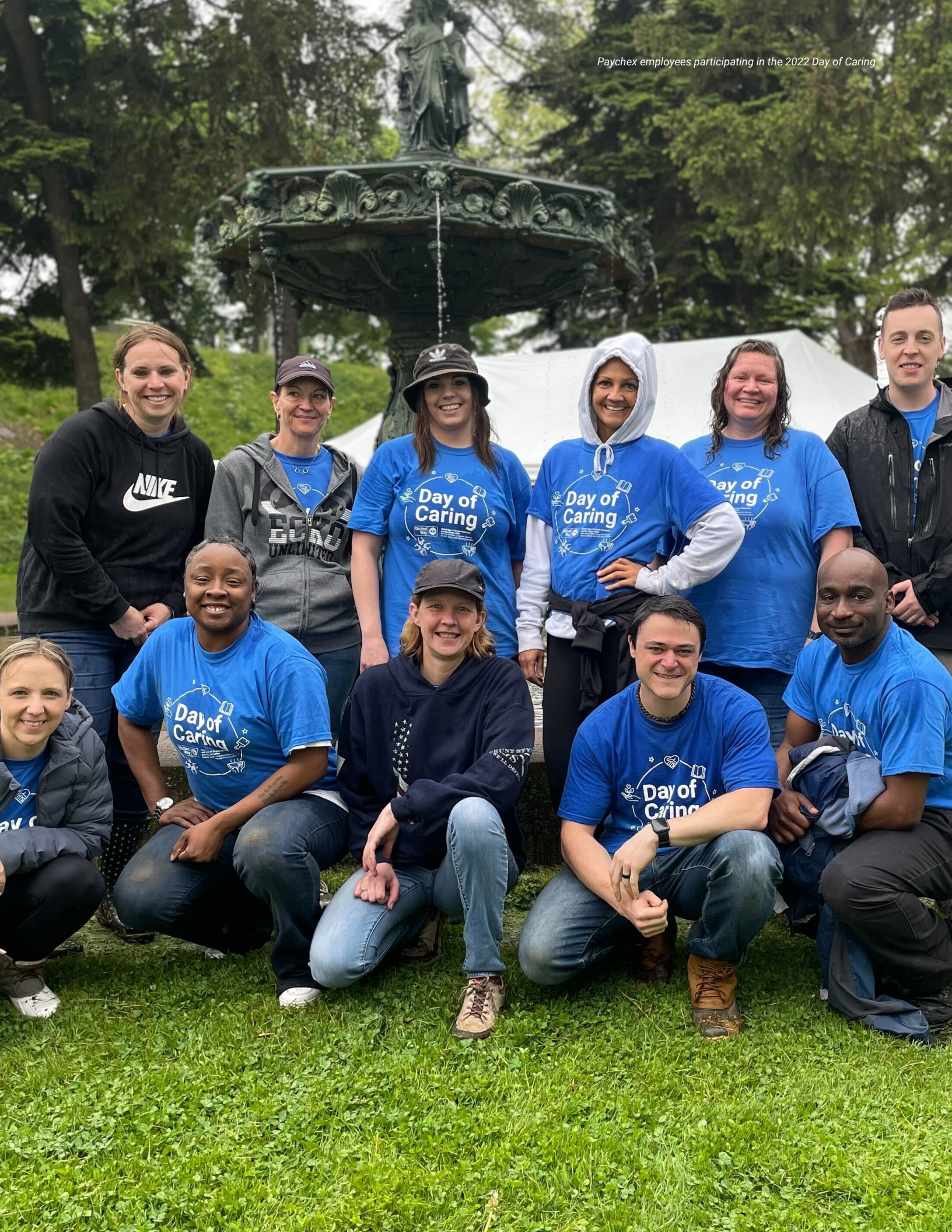
Paychex employees participating in the 2022 Day of Caring